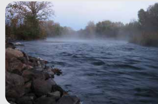
A view from one of several watercraft campsites.

Hazards include downed trees, snags and dams. Be sure you know where portages are located. A portion of the river near Princeton has frequent log jams, use caution.